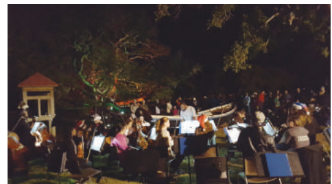
The Manatee High School Orchestra played holiday favorites at the Visitor Center.