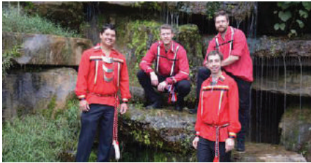
Award-winning Native American group Injunuity comes to DeSoto in February.

I njunuity will entertain visitors at the Concert on the Lawn beginning at 5:30 p.m. Feb. 27.